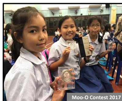
Moo-O Contest 2017