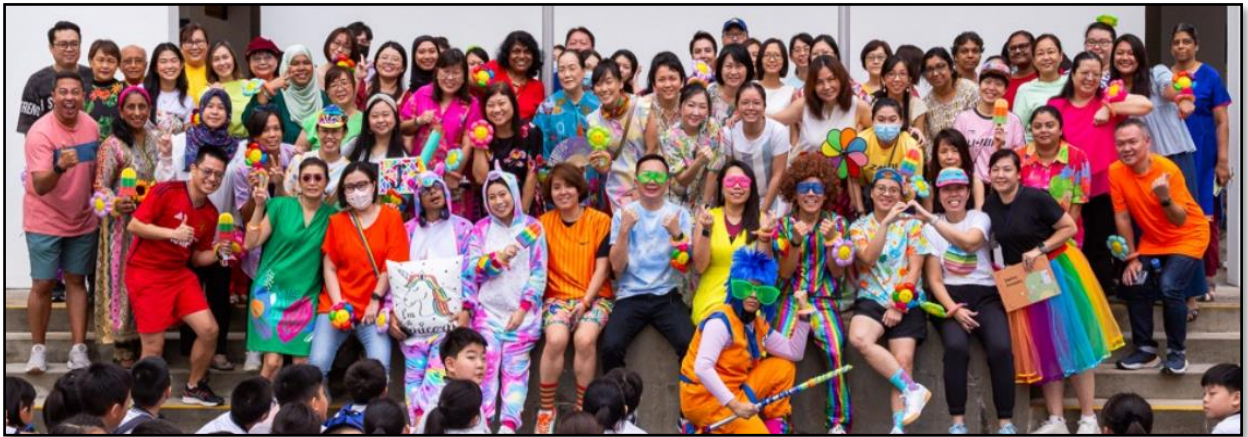
Picture taken on Teachers' Day 2024 where the theme was 'Harmony of Colours'

On behalf of our vibrant staff, we wish every Kheng Cheng School student a fantastic Children's Day! We are excited to celebrate the joy, curiosity, and creativity that our students bring to school every day. This special day serves as a reminder of the importance of nurturing and guiding our children, helping them grow into compassionate and responsible individuals.