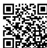
Tiny Moments That Matter