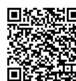
School Services Survey Instructions